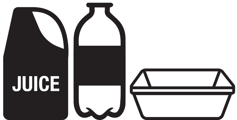
Plastic bottles and containers (lids removed)

Items must be rinsed, empty and loose in the bin.