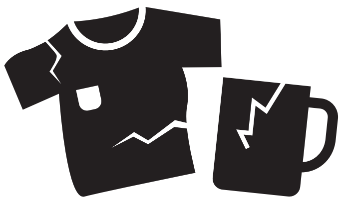
Damaged items (clothing and ceramics)