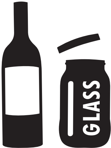
Glass bottles and jars (lids removed)